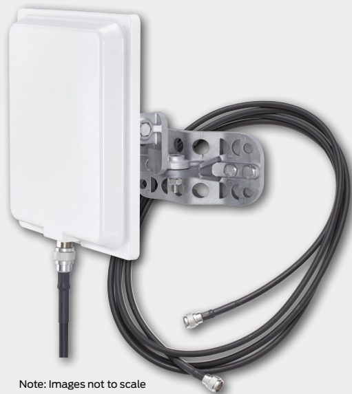
Note: Images not to scale

AD Series remote antennas are important components to environments with limited installation flexibility. The connected PIM400 can be up to 15 feet away from the remote antenna via the included coaxial cable. The outdoor rated antennas create new applications that allow a PIM400 to communicate to external remote access points such as gates or remote buildings without the need to trench cables.