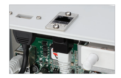
PIM400-1501-LC has RJ-45 and USB external connectors to make installation easy.

Allegion, the Allegion logo, Schlage and the Schlage logo are trademarks of Allegion plc, its subsidiaries and/or affiliates in the United States and other countries. All other trademarks are the property of their respective owners.