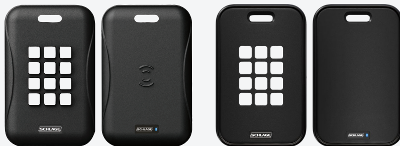
Reader cover style C1